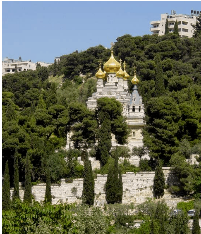
The Russian Orthodox Church of Mary Magdalene, located on the West slope of the Mount of Olives.

Matthew 24 thus emerges as a key prophetic passage. Those who spiritualize prophecy (Amillennialists and Postmillennialists) either argue that its tribulation prophecies were fulfilled in