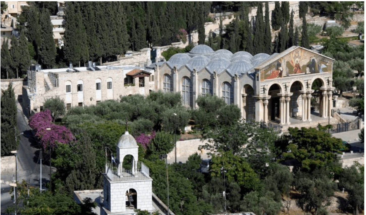
The Church of All Nations is located at the base of the Mount of Olives, adjacent to the Garden of Gethsemane. It commemorates the traditional site of Jesus’s agony before His arrest.

Olivet Discourse is also recorded? These were Gospels written to the Gentiles. Also, the Olivet Discourse was probably delivered only a few days before Jesus spoke the words of John 14 to His disciples. Those who deny that Matthew 24 has any relevance to the Church are the same persons who believe that the promise of the Rapture in John 14:1-4 was meant for the Church. Both speeches were delivered by Jesus to Jewish audiences, and both were delivered before the Church was established.