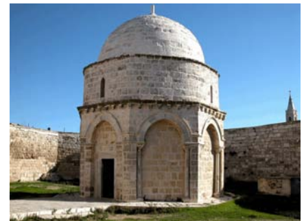
Dome of the Ascension. The spire of the Russian Church can be seen on the right.

Our cover photo shows a spire at the pinnacle of the Mount. It is the Russian Church of the Ascension. It marks one of two traditional sites from which Jesus ascended into Heaven (Acts 1:1-11). The other site located nearby is more authentic but is controlled today by Muslims who have transformed a small and ancient domed church on the site into a mosque.