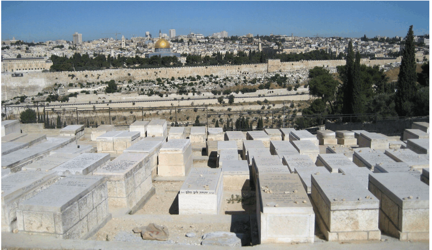
A view of the Old City of Jerusalem looking west from the Mount of Olives. The Dome of the Rock and the Eastern Gate are in the distance, across the Kidron Valley. In the foreground are some of the tens of thousands of graves that cover the western slope of the Mount. Orthodox Jews desire to be buried on the Mount of Olives because they believe, based on Zechariah 14, that the Messiah will come to that site when He comes to earth, and they want to be the first to be resurrected.

To say the Olivet Discourse has no relevance to the Church is equivalent to saying that the Old Testament has no relevance because it was written by and for Jews. Or, that the letters Paul wrote to the Corinthians have no relevance to the Church at large because they were directed to a particular First Century congregation.