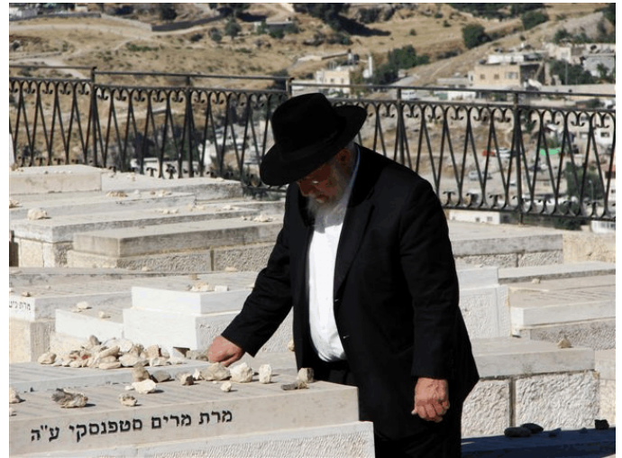
An Orthodox Jew pauses to pay tribute at a tomb on the Mount of Olives. The proper way to do this is to leave a “stone of remembrance” on the top of the tomb.

But I respectfully disagree with that position. I believe Jesus mentions the Rapture in verses 36-44 of Matthew 24. The first reason I see the Rapture in these verses is because Jesus says, “of that day and hour no one knows . . .” How could He possibly be referring to His Second Coming? Keep in mind that He has just told His disciples exactly when He was going to return —