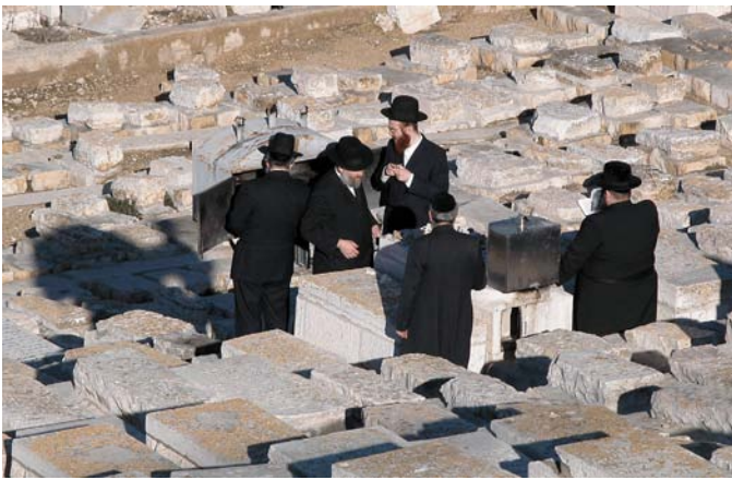
Orthodox Jews tending to a tomb on the Mount of Olives.

Over four hundred years ago the Puritans seized on this passage and argued that one day Israel would be re-established and that when that happens, the generation that witnesses it will be the generation that will experience the Lord's return.