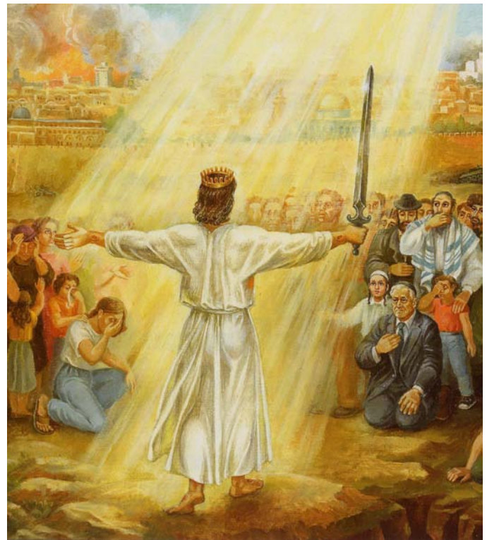
“Yeshua Returning to the Mount of Olives,” a painting by a Messianic Jew in Israel (cropped).

I decided to take this remarkable passage to my pastor and